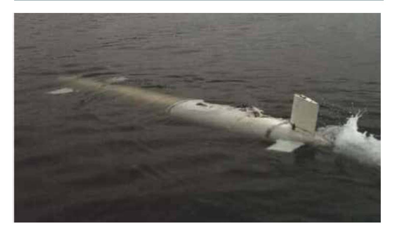
Theseus was retired after the final mission in 1996. It is still owned by Defence Research and Development Canada and is stored at ISE.