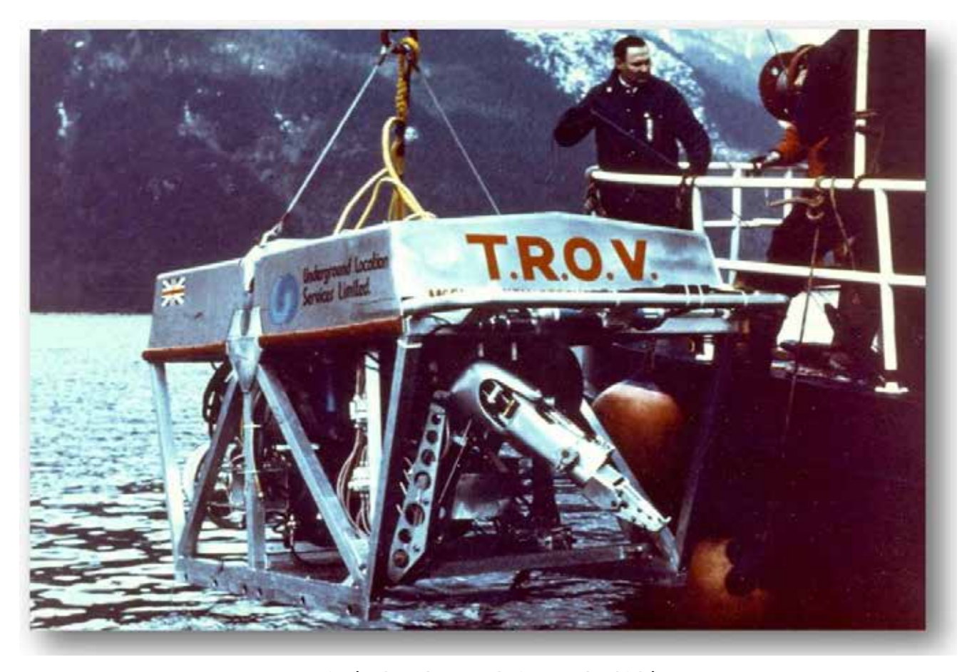
TROV (Tethered Remotely Operated Vehicle) One of the first ROV's developed by ISE in 1976

ISE's ROV product lines form one of the core elements of its overall business structure. We have designed and built ROVs for commercial, scientific and military applications. Our ROV's are delivered in standard or custom configurations to meet our customer's requirements from 5 to 600HP and up to 6000 meters of depth.